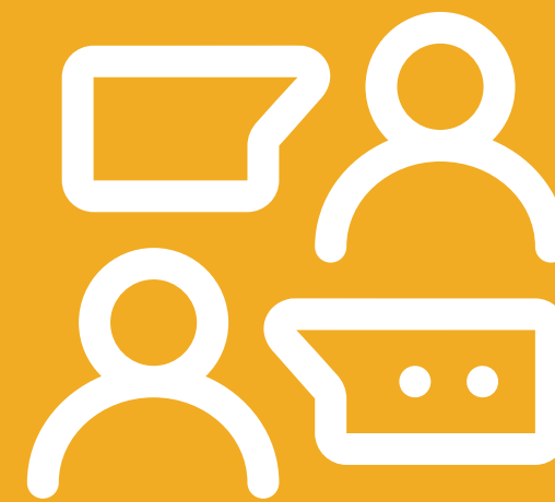
III. Communications, Outreach & Marketing