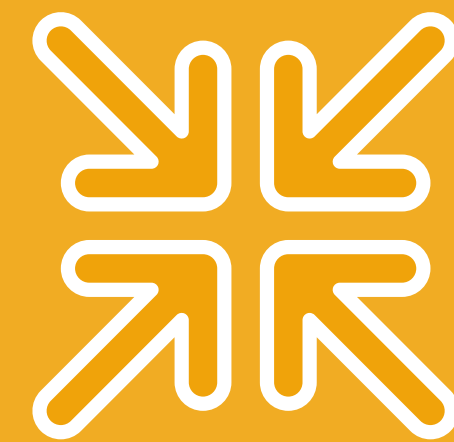
IV. Focus Areas