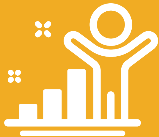
I. Business Retention, Expansion & Recovery