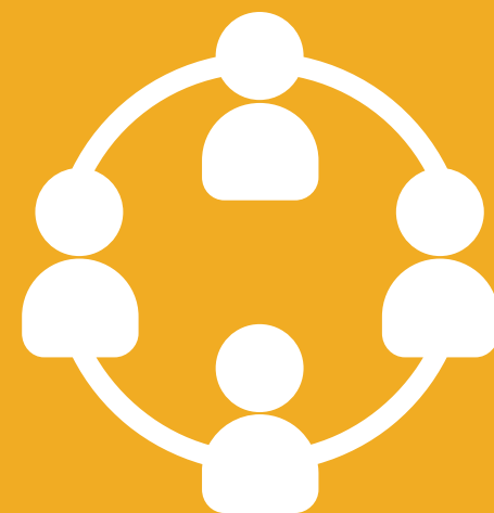
II. Organizational & Resource Development