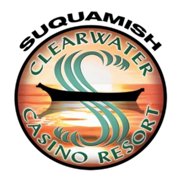
Clearwater Casino – December 27, 1995