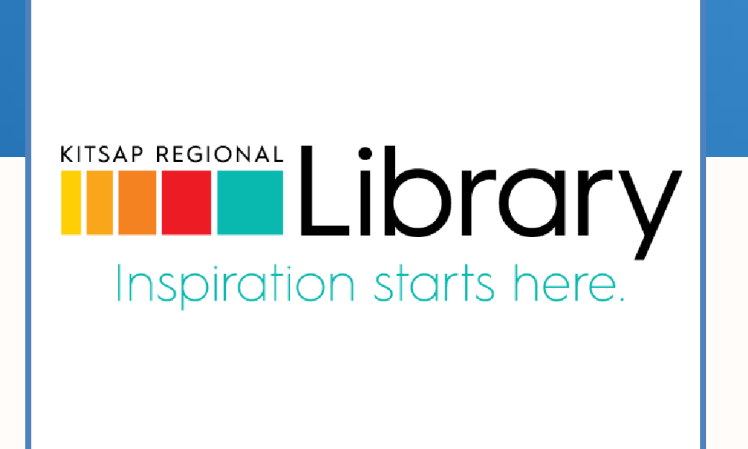
Kitsap Regional Library